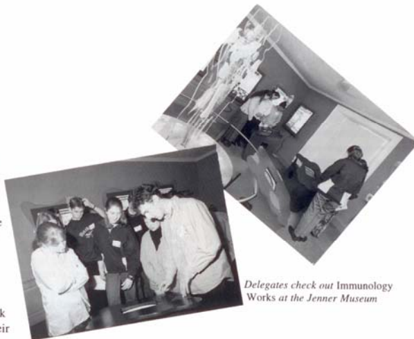
Delegates check out Immunology Works at the Jenner Museum

We hope that the links forged with 11 schools throughout Avon and Gloucestershire will encourage them to make use of the excellent facilities at the Jenner Museum. The response from the delegates was overwhelmingly positive and we hope to stage a conference at the Jenner Museum annually - in fact many of this year's delegates asked if they could come again!